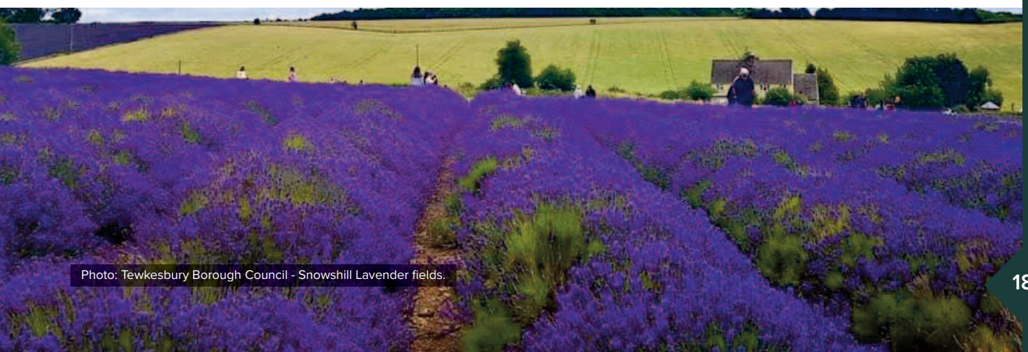
Snowhill Lavender fields.

Not all of our services can be represented within the Council Plan, and some will be carried out as business-as-usual through departmental service plans. These will be monitored as part of our dedication to becoming a High Performing Organisation (HPO). More information on our HPO programme, including how it aligns with our Council Plan, can be found on page 19.