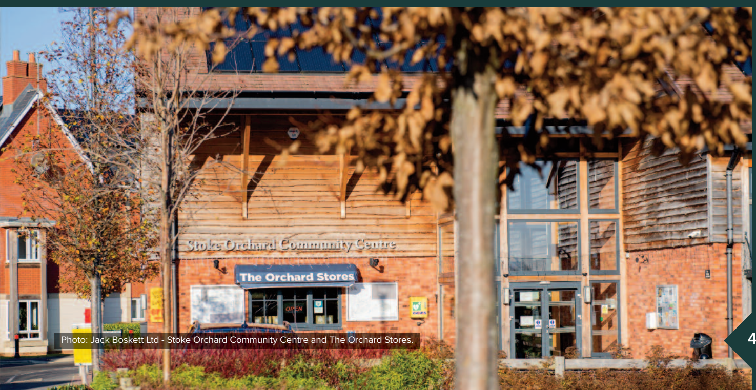
Stoke Orchard Community Centre and The Orchard Stores.

We want everyone to feel valued and heard. We are committed to fostering an inclusive environment where individuals, regardless of their backgrounds, disabilities, identities or perspectives are welcomed and represented.